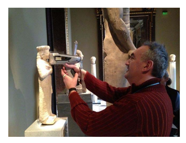
Fig. 2.: In situ application of a hand-held X-Ray Fluorescence analyser for the non-destructive examination of the traces of polychromy remained on the surface of ancient marble sculptures (Kunst Historisches Museum, Vienna, source: IAEA homepage)

1. ábra: A 2011-ben Ankarában tartott "A kulturális örökség tárgyainak vizsgálata nukleáris módszerekkel" c. regionális tanfolyam plakátja