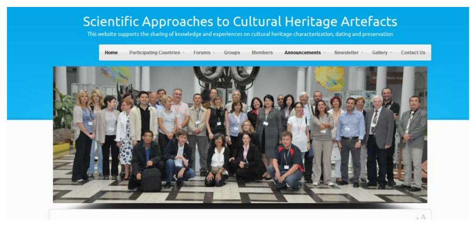
Fig. 4.: The starting page of the IAEA RER 0034 TC project web site, 2012, http://nuclculther.eu/

Nuclear Techniques for Cultural Heritage Research, IAEA Radiation Technology Series No. 2, International Atomic Energy Agency, Vienna 2011.